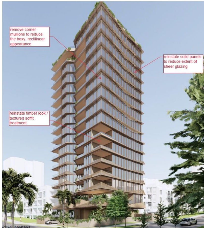
Figure 1: Annotated Perspective